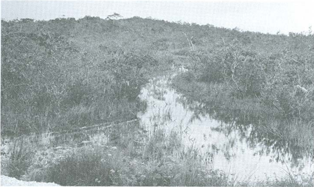
Fig. 4. Dry season track leading toward Celestun with a peten in the background. Black mangrove dominates areas between petenes and outside the savannas. September 1977.

ered, forming savannas that have been present at least since 1675, as they were mentioned by Dampier in his travels (Dampier 1906, 121). The savannas occur inland from 1 to 7 km from the beach and extend from near Sisal south to the vicinity of Isla Arenas. They are still burned periodically, probably by hunters, chicle collectors, or loggers, and this has created an expanse of grassland with scattered petenes.