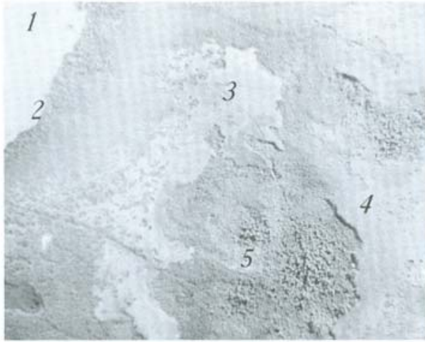
Fig. 2. Aerial View of vegetation near Celestun. (1) Estero (estuary) de Celestun; (2) red mangrove; (3) canals; (4) savanna; (5) peten. Aerial photos, 1960, courtesy INAH, Merida. Scale approximately 1:20,000.