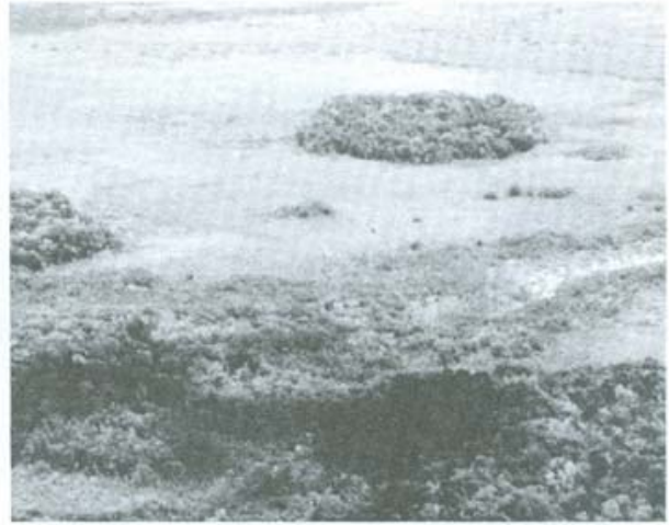
Fig. 3. Aerial view of petenes and savannas near Celestun, March 1976.